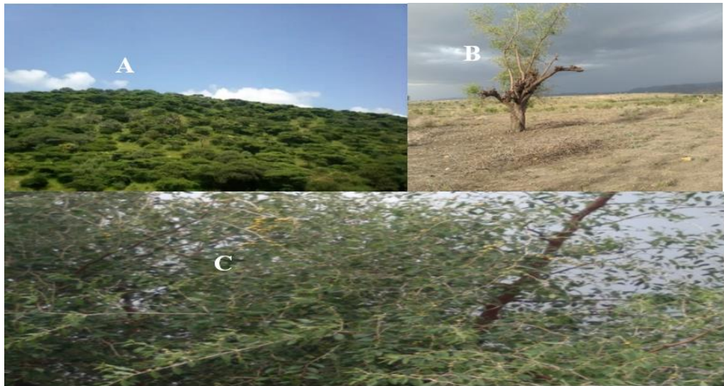
Fig. 2: Native tree/ shrub species in remnant natural forest (A), parkland agroforestry (B), and homegarden (C)

Therefore, an inventory of native fodder and fruit tree/shrub species was conducted in homegarden, parkland agroforestry, and remnant natural forest. Inventory of homegarden and parkland was done from randomly selected 30 households of the total households (N=127) that had native fodder and fruit species. The plot size was 20 m×20 m for homegarden and 50 m × 100 m for parkland to conduct tree/shrub inventory (Gebre et al. , 2019; Manaye et al. , 2021). This represents 15 households from each of the two main land use types (homegarden and parkland) in each kebele, for a total of 30 households per kebele and 60 households in total.