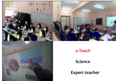
Fig. 3 The footages combined side by side.

The recording system achieves three classroom footages: one from the eye-tracking glasses and two from the stationary cameras positioned at two different angles of the classrooms. The three footages were combined side by side for the analysis of lessons.