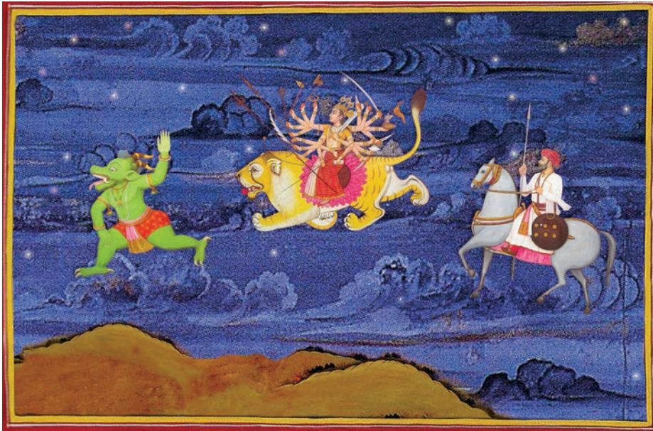
Figure 4.2: Night of November 6, 1093, SaktiMa, her Shiva incarnate husband Jhallesvar Raj Harpaldev, and demon servant Babrusur, ride to form the future kingdom of Jhalavad.