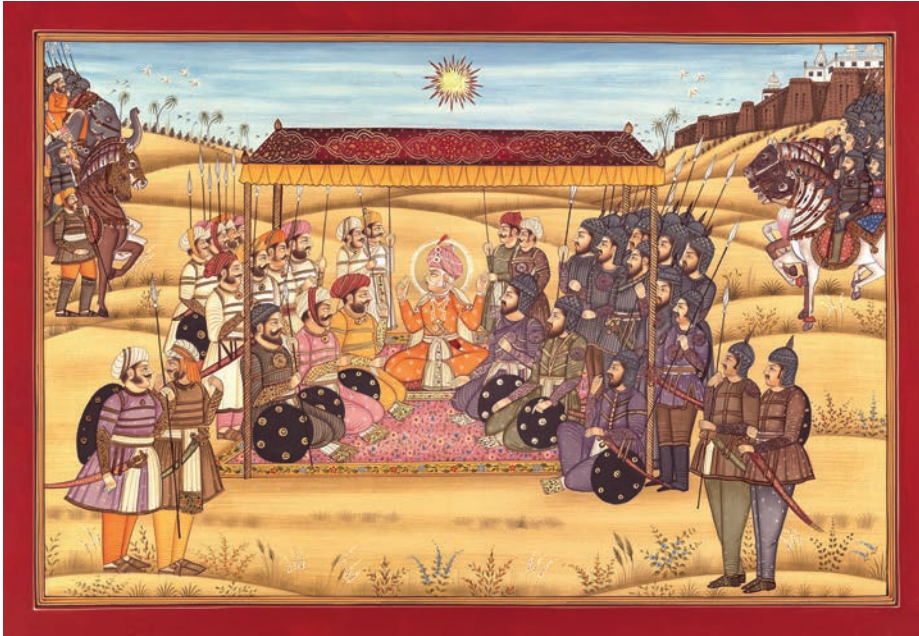
Figure 4.6: Before 14 July 1591, near the battlefield of Bhucharmori, Jhallesvar Raj Chandrasinhji negotiates peace between the forces of the Mughals and the Sultan Muzaffar III and his Muslim, Jadeja and Kathi allies. He was brother-in-law of Mughal crown Prince Salim and his sister was married to the Jadeja Jam Sataji.

With Rayasinh's death the title reverted to his son, Chandrasinh. Having witnessed two bloody battles in his youth, the first at Dhrol in which his father's maternal uncle and his father's enemy, Jassaji had been killed, the second at Malia in which his brother had died and from which his father had disappeared for 19 years, Chandrasinh had an aversion to war and bloodshed. Nevertheless, he did not shy away from his duty when needed.