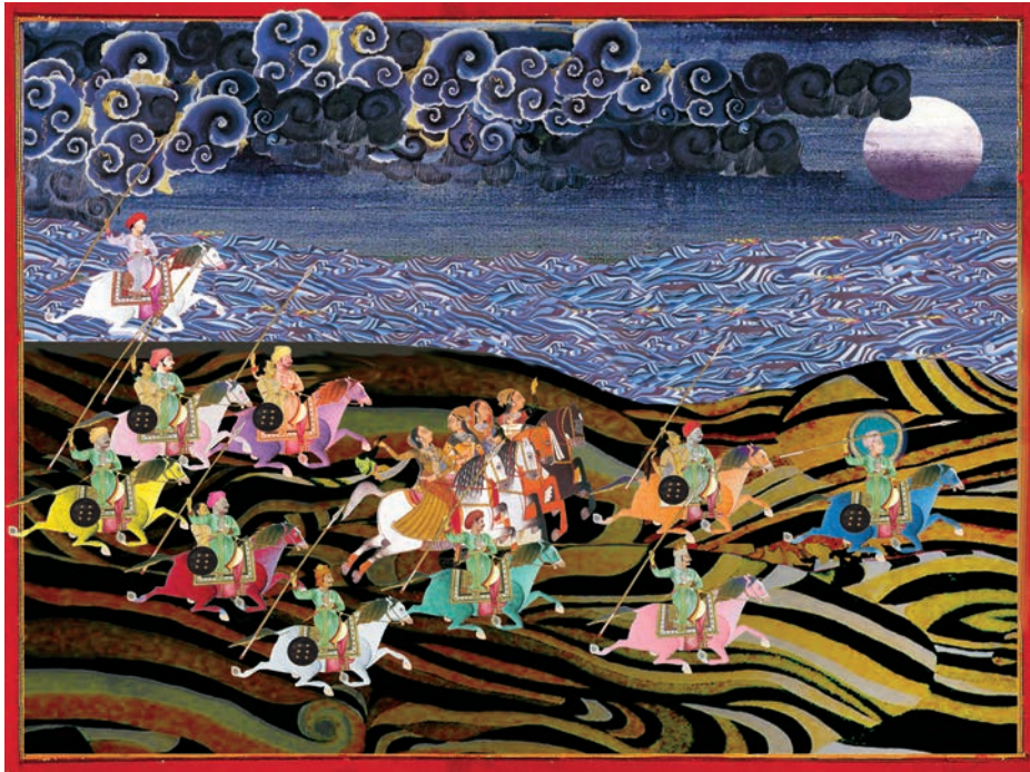
Figure 4.1: Raj Kesardevji rescues Rajput women captured by Hamir Sumra, 1073.

Within the exhibition of paintings 18 there are two that cover this period. One painting depicts Harpaldev's father, Kesardev, leading his troops against Hamir Sumra, Sultan of Sindh, in which he defeated the Sumra army and rescued women who had been captured by them. A second painting depicts the magical night ride with the demon Babro and the Goddess Shakti-Ma as Harpaldev establishes the Makhavana kingdom by festooning 2300 villages from a celestial winged chariot, though the painting actually shows him riding a horse.