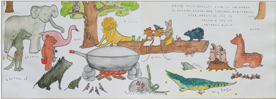
Figure 1. Sample Book Page From a Japanese Book

Note. Sample book page from a Japanese book, GURI and GURA (Text © Reiko Nakagawa 1963, Illustration © Yuriko Yamawaki 1963, Published by Fukuinkan Shoten Publishers Inc.). The black bold line (imposed on the faint line originally given by the NIH Image J software) shows the perimeter of the character measured by the NIH Image J Measure Area function using the rectangle area selection tool.