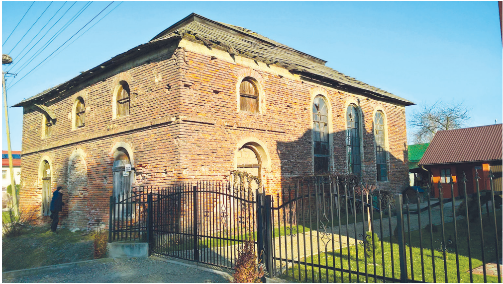
Fig. 5. Synagogue in Medyka nowadays

According to the population count from 1870, in 74 county towns of Galicia people of the Roman-Catholic faith constituted 40.8%, the Greek-Catholic 15.7%, Evangelical 1.1% of the overall population; Jews constituted 42.2% [22]. Jews lived both in smaller towns and bigger cities. In 27 towns of Western Galicia Jews constituted 35% of inhabitants [22, p. 54]. Towards the end of the 19 th century, in Dębica, Dukla and Tarnobrzeg the number of Jews exceeded 80%. In many towns they constituted more than half the number of inhabitants (Cieszanów, Kolbuszowa, Lesko, Lutowska, Niebylec, Przeworsk, Rzeszów, Sanok and Wielkie Oczy) [16, p. 15].