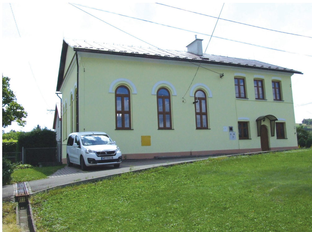
Fig. 6. Synagogue in Niebylec nowadays

During the 1630s, a new type of spatial solution in a synagogue was created – with the so-called nine-square room. Two types of solutions were used in such synagogues: rooms with squares of equal size and rooms with the smaller central square. The layout was still popular in the 18 th and 19 th century. An example of a room with an identical arrangement of columns dividing the space into nine squares of the same size is the Nowomiejska Synagogue in Dębica (2 nd half of the 18 th c.) Another example of a nine-square room with all the squares of the same size is the main prayer room in the Big Synagogue in Jarosław (1811). Two examples of nine-square rooms with a smaller central square have been preserved in Podkarpackie Voivodeship: the Nowomiejska Synagogue in Rzeszów (1705–1712) and the synagogue in Strzyżów. The Nowomiejska Synagogue, rebuilt and converted in the years 1954–1963 into the BWA art gallery, lost its former shape. The synagogue in Strzyżów, despite post-war