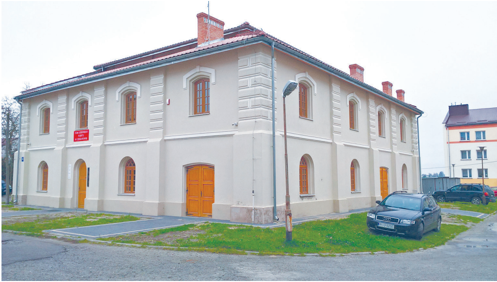
Fig. 1. Synagogue in Cieszanów nowadays