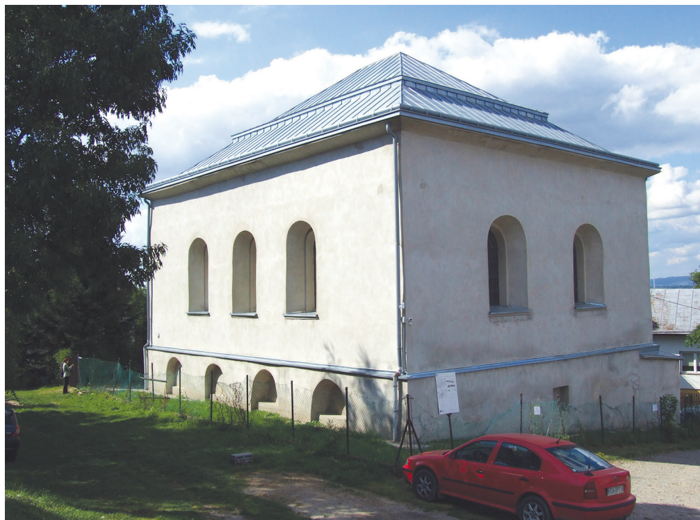
Fig. 7. Synagogue in Rymanów nowadays

The second example is the rebuilt synagogue in Wielkie Oczy, which at the beginning of the 1990s was still in ruins. It was then that local cultural organisations began to cooperate with the parish in Wielkie Oczy and descendants of the Jewish community in the village, in order to carry out a renovation of the synagogue and its adaptation to a centre of culture and a library. In 16 June 2013, the renovated building of the former synagogue in Wielkie Oczy was officially opened. An Exhibition Room was opened in the restored synagogue, where original objects were collected from the times when Jews constituted a third of the town's