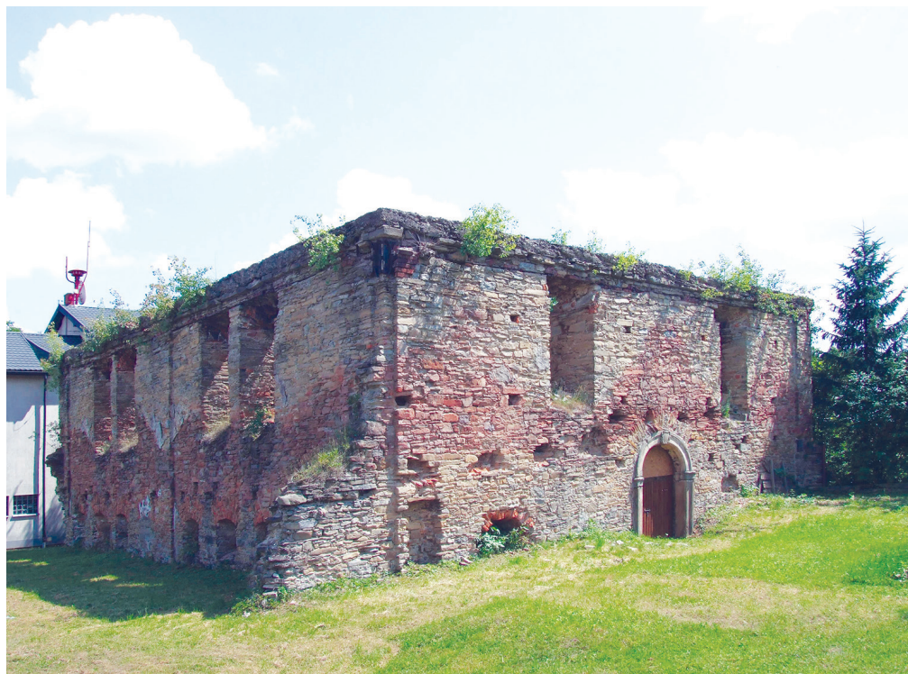
Fig. 3. Ruins of synagogue in Dukla nowadays

Ne of the most important books concerning masonry synagogues is the volume by M. and K. Piechotka Bramy Nieba. Bóżnice drewniane na ziemiach dawnej Rzeczypospolitej , published in Warsaw in 1999 [14]. By showing the phenomena that influenced the architecture of synagogues, as well as in-depth studies of the history of Jews in Poland, the book explains the origins and development of synagogue architecture in Polish territories. Valuable elements of the book are archive photographs, inventories, descriptions and origins of 82 synagogues erected between the 16 th and the beginning of the 20 th century. In the chapter devoted to the synagogues from the 16 th and the first half of the 17 th century, we can find information about the Staromiejska Synagogue in Rzeszów; in the chapter 'Synagogues from the second half of the 17 th century and the beginning of the 18 th century' there is information concerning the Nowomiejska Synagogue in Rzeszów, and in the chapter 'Synagogues from the 18 th and the beginning of the 19 th century' one can find descriptions, inventory sketches and photographs of the synagogues in Łańcut, Rymanów and Lesko. In the final chapter, devoted to synagogues