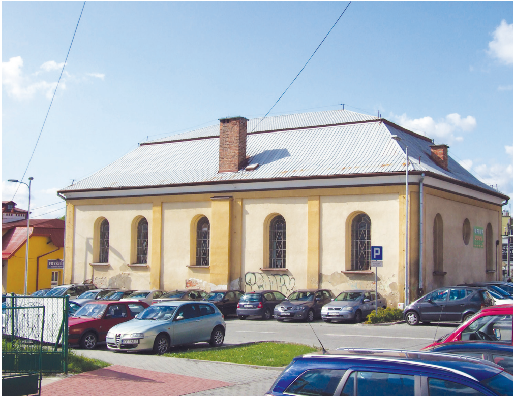
Fig. 2. Synagogue in Dębica nowadays

Before 1939, in the course of the research work in ZAP and CBIZ, over thirty synagogues located in the lands of the 2 nd Republic were inventoried and photographed.