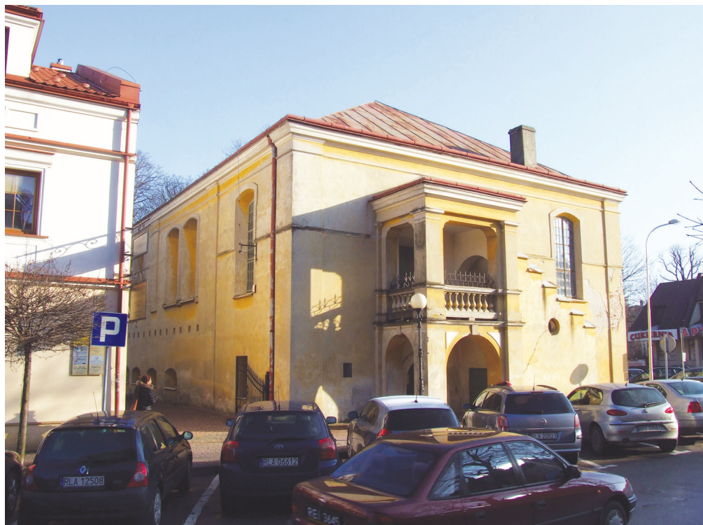
Fig. 4. Synagogue in Łańcut nowadays

Writing about the state of research on the Polish synagogue architecture with a particular stress on the Podkarpacie region, one has to mention such source material as the Monument Cards. As far back as the 1950s the National Monument Conservation Laboratories commenced the first research and inventory of the most valuable buildings of former synagogues or their ruins. Most frequently, the work was conducted in order to rebuild and