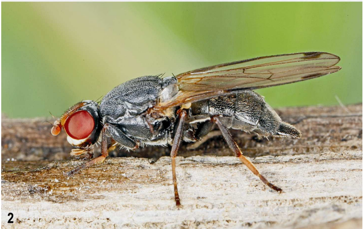
Figs 1-2: Homalocephala albitarsis Zetterstedt and its habitat. 1 – fallen oak ( Quercus robur ) trunk on gravel bank of Smědá river, where H. albitarsis specimens occurred; 2 – female in lateral view (body length 6.2 mm).