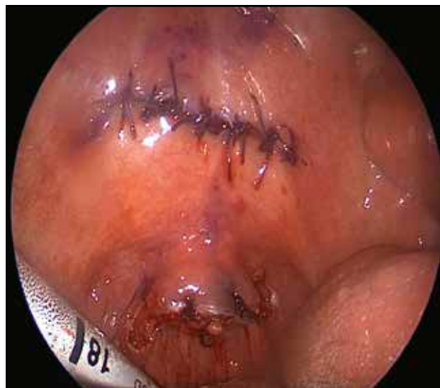
Figure 4. Final view of anterior palatoplasty, uvula reduction and posterior tonsillar pillars vaporization (intraoperative view).

Also, all patients were advised to follow a diet of