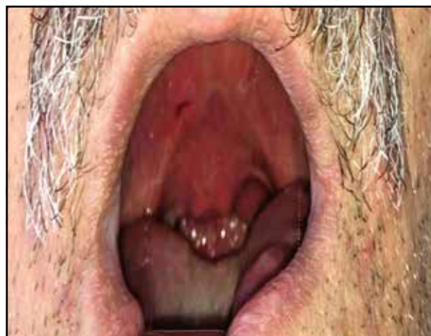
Figure 5. Postoperative aspect at 3 weeks after surgery (anterior palatoplasty and reduction of the uvula).

The study's outcome measures utilized subjective and objective methods to evaluate improvement. Subjective improvement in daytime sleepiness was quantified using the ESS. Objectively, the efficacy of the AP was evaluated by analyzing the changes in the polysomnographic data. This objective data was instrumental in assessing the physiological improvements in sleep patterns and breathing, offering a scientific basis to deter-