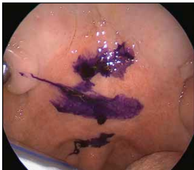
Figure 1. Anterior palatoplasty intraoperative picture – palatine veil marked.

Patients were evaluated with one night polysomnography and completed also ESS before the surgery.