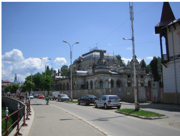
Figure 14. The former casino in Vatra Dornei; under reconstruction at the time of the photo

Cârlibaba, were settled by migrants from the Zips (Offner 1995) and still host a small German community, although they have a lesser impact on the cultural landscape.