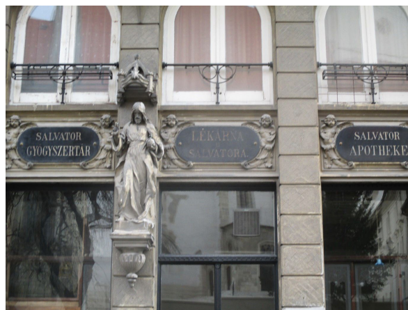
Figure 3. An old pharmacy in Bratislava's historical centre bears inscriptions in Hungarian, Slovak, and German ( Salvator Apotheke )

What is most striking is the fact that the name of the region derived from its former German population, Zips (in Slovakian Spiš and in Hungarian Szepes ) – admittedly also supported by the fact that it constituted a Hungarian county for centuries – remained the popular name of the landscape. It is reflected not only in the names of populated places (e.g. Spišská Belá , Spišská Nová Ves , Spišská Stará Ves , Spišské Podhradie , Spišské Vlachs , Spišský Štvrtok ) but also in ecclesiastical-administrative affiliation (a Zips diocese comprising the historical Zips region), and even in a soccer league and the names of commercial enterprises (see Hofer 2012). The landscape identity remained, although since 1996, the territorial-administrative division of Slovakia cuts it into two halves at the first administrative level below the state, the level of regions [kraje], where the Zips is divided into the Prešov