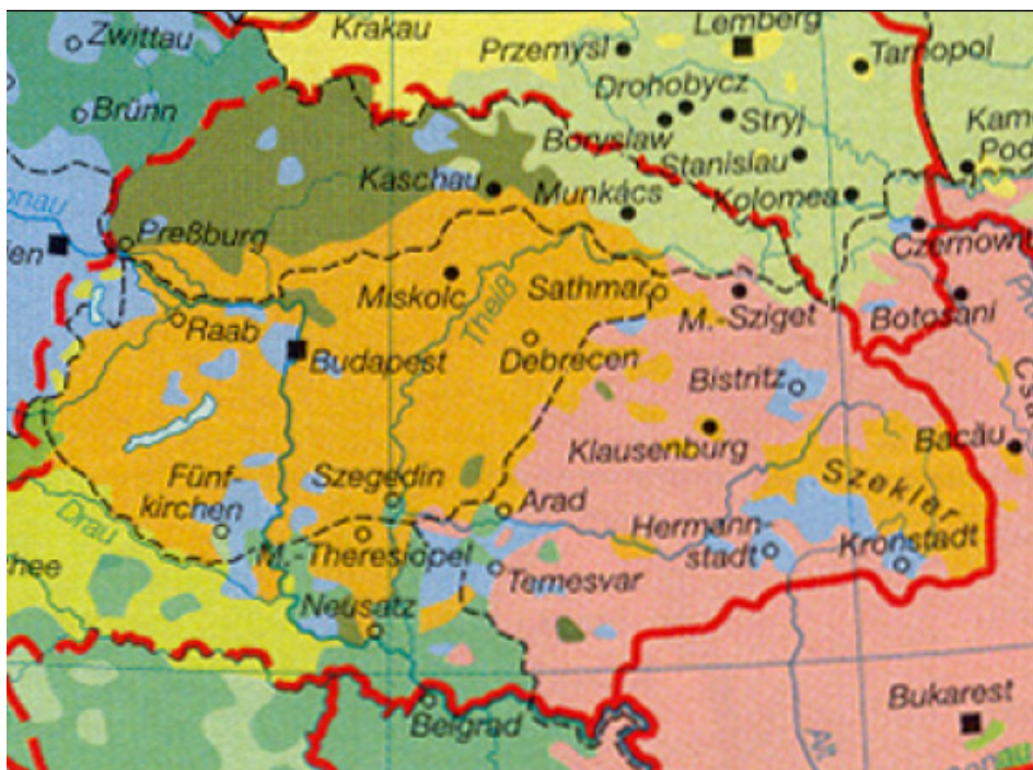
Figure 1. Local concentrations (in blue) of German speakers (by mother tongue in the Kingdom of Hungary and colloquial language in the Austrian Crownlands) in the eastern parts of the Habsburg Monarchy in 1910. Thick red lines indicate international borders in 1910. Broken thick red lines show the borders between the Austrian Crownlands and the Kingdom of Hungary and the Condominium of Bosnia and Herzegovina – the political entities of the dual monarchy below the level of the Empire. Broken thin black lines show, for comparison, the borders after 1918.

Bardejov (German Bartfeld ), which had considerable shares of German inhabitants. The places where there was a German minority in and near the Carpathians in modern Czechia, Poland, and Ukrainian Transcarpathia [Zakarpat'tja] are too small to be represented due to the scale of this map. In the modern Ukrainian Bukovina [Bukovyna], the city of Chernivtsi [Černivci] (German Czernowitz ) stands out as a German settlement centre. In the modern Romanian part of Bukovina [Bucovina], the upper valley of the river Bistrița with Vatra Dornei is marked as settled by Germans. In Romanian Transylvania proper [Ardeal, Transilvania], the Royal Lands (in German Sachsenboden or Königsboden 1 ) near Sibiu/Nagyszeben/Hermannstadt, the Burzenland [Țara Bârsei] around Braşov/Brassó/Kronstadt, and the Nösnerland [Țara Năsăudului] around Bistrița/Beszerce/Bistritz are three compact regions of German settlement. In the lowlands of the Romanian Banat around Arad and Timișoara/Temesvár/Temesvar, as well as in the Banat Mountains [Munții Banatului], German communities are represented; they can also be found in the Szatmar region near Satu Mare/Szatmárnémeti/Sathmar.