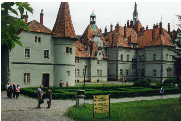
Figure 6. The former Schönborn Palace near Mukačevo in Transcarpathia, now part of the Sanatorium “Karpaty”.

Saxons because this was the contemporary ethnonym for all kinds of Germans in south-eastern Europe, although they did not descend from Saxony [Sachsen], but mainly from the Mosel-Rhine region in what is today Rheinland-Pfalz and Luxembourg, and they spoke a Mosel-Franconian dialect (see Buza 1999; Nägler 1981). They settled wider parts of the Transylvanian Basin, with concentrations in the Burzenland, the Nösnerland [Țara Năsăudului], and, most significantly, the Royal Lands (German Sachsenboden or Königsboden ), where they were later (1224) granted autonomy and exclusive settlement (Jordan 1998; Kocsis 1990, 1992; Limonta 2008; Săgeată, Buza & Crăcea 2017). 4 The Transylvanian Saxons were traders, craftsmen, and free farmers, and founded towns and cities and became, in the Principality of Transylvania (from 1437 up to 1876), one of the three pillars of its autonomy (besides the Hungarian nobility and the Szeklers). During the Protestant Reformation, they almost all converted to Lutheranism, guided by their own reformer Johannes Honterus from Brașov/Brăso/Kronstadt, and this confession remained a major marker of their identity, and included founding confessional schools with tuition in German that persisted throughout the Romanian nationalist interwar period and even the Communist era.