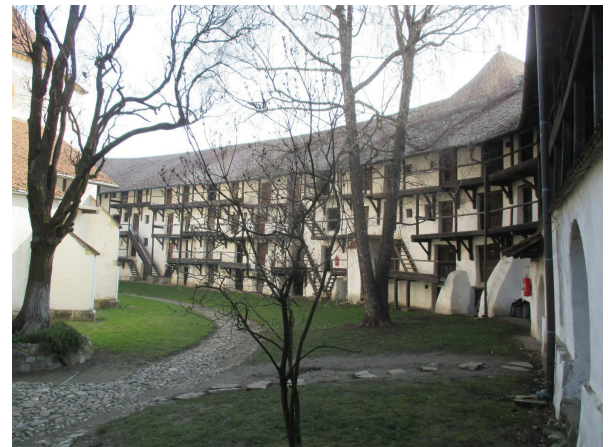
Figure 8. The wall of the fortified church of Prejmer (German Tartlau), with flats and stores