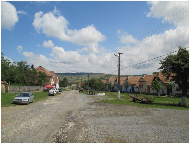
Figure 9. Viscri (German Deutsch-Weißkirch), a typical Saxon “Angerdorf” in south-eastern Transylvania, today mainly inhabited by Roma