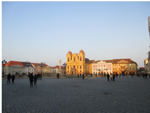
Figure 11. The Roman Catholic cathedral of the Hungarians and Germans at the old main square of Timișoara