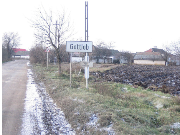
Figure 12. The Swabian village Gottlob in the Banat plain has its German name on the official town sign

spas of that time; however, it is deplorably maintained (Fig. 13).