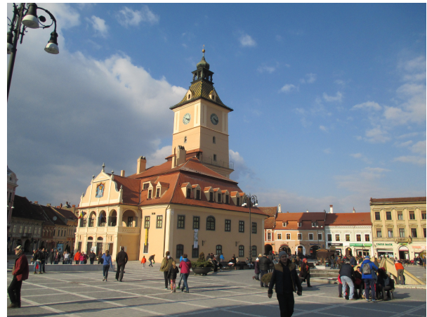
Figure 7. The former town hall on the triangular main square in Brașov's historical centre

The historic centres of cities of the Romanian Banat and the eastern fringe of the Pannonian Basin are shaped by Hungarian rather than German culture – many, however, by both. One of these is the old main square of Timișoara/Temesvár/Temesvar, dominated by the Roman Catholic cathedral of the local