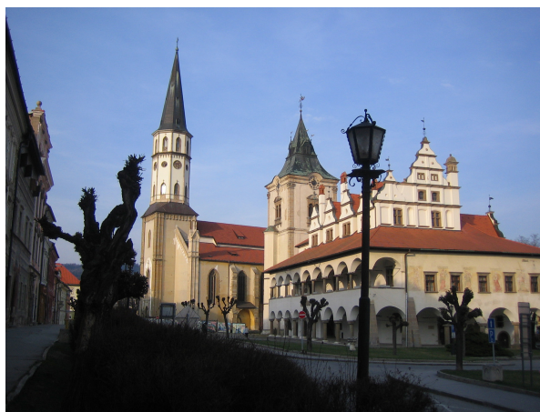
Figure 4. Basilica of Saint James [Bazilika sv. Jakuba] and the old town hall of Levoča (German Leutschau ) in the Zips.

[Prešovský kraj] and Košice [Košický kraj] regions. 2 Thus, as in the cases of Polish Silesia [Śląsk] and Slovenian Kočevje, a regional identity shaped by a historical German population is, after 1945 and in the absence of their creators, perpetuated by the new settlers of a different ethnic origin.