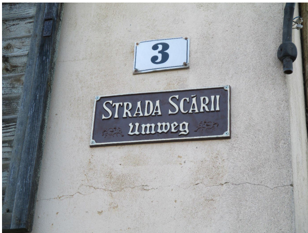
Figure 10. Street sign in Sighișoara (German Schässburg), a reminder of the old German street name Umweg