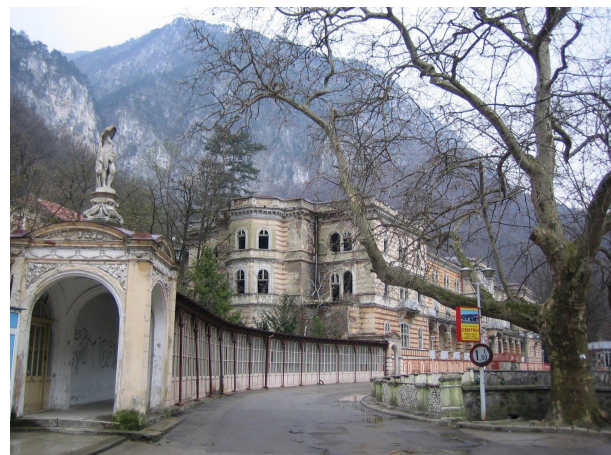
Figure 13. Abandoned 19th century spa facilities in Băile Herculane

German settlement in the mountainous parts of these regions was confined to some remote places and has, thus, left just island-like traces in the current cultural landscape. In the Romanian Bukovina (for the Ukrainian part, see subchapter 2.4), they are most obvious in Vatra Dornei (German Dorna Watra ), that first started to develop as a health resort in the late 19th century under Austrian rule, and shows all the markers of a spa of that time, including a proud hall for taking waters and a casino (Fig. 13). In the upper valley of the river Bistrița, between Vatra Dornei and the Prislop mountain pass, the iron mine Iacoberni (German Jakoberni ) and the village Cârlibaba (German Kirlibaba ), a settlement of Lutheran Germans from the Zips in the later 18th and 19th centuries, retain remarkable traces. Cârlibaba is still inhabited by some Germans, and runs an elementary school that also offers tuition in German. At the Maramureș side of the same mountain pass, Borșa (German Borscha ), Vișeu de Sus (German Oberwischau ), and Vișeu de Jos (German Untewischau ), like