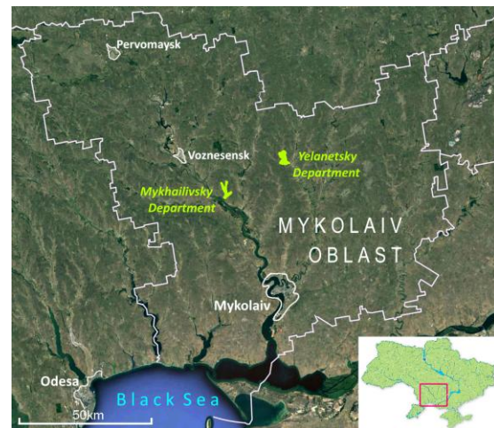
Fig. 1. Location of scientific research departments of the Yelanetsky Steppe Nature Reserve in the territory of Mykolaiv Oblast

The territory of the reserve is a landscape complex of ravines and dry valleys with preserved steppe, petrophyte-steppe and shrubby plant communities (Fig. 2). In the Yelanetsky Department there are large steppe ravines: Roza, Orlova and Prusakova. In the Mykhailivsky Department there are steppe ravines: Gorskina, Divka, Velyka Divka, Kemlycha and Hnyla.