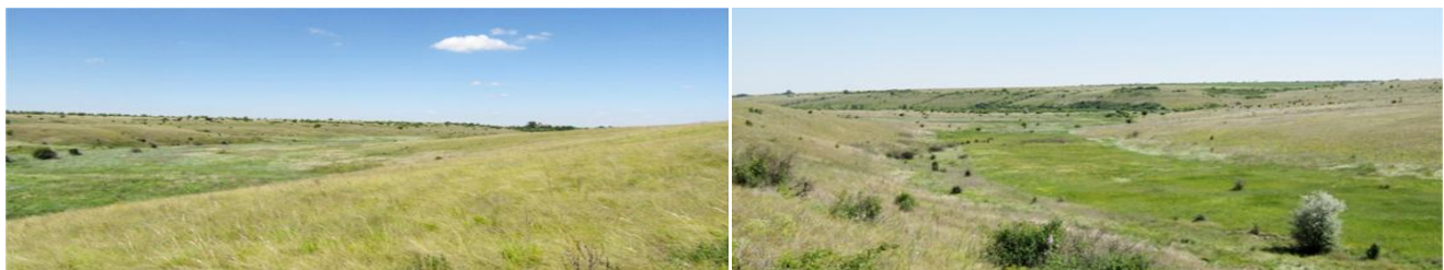
Fig. 2. Landscapes of the Yelanetsky Steppe Nature Reserve: A – Prusakova ravine, B – Orlova ravine