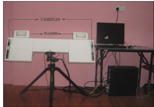
Figure 1. The VECTRA-3D dual module camera system for full-face imaging.

Thirty facial images of Semai people, 15 males and 15 females aged 20 to 25 years, were captured during a research visit to an aboriginal settlement in the west of the Peninsular Malaysia. Ethical approval for this study was obtained from the Research Committee of the Faculty of Dentistry, University of Malaya. Verbal and written consent was also obtained from the participants.